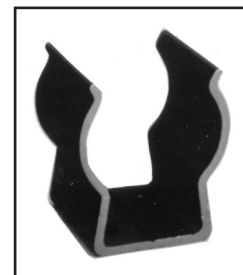
8012C Mounting Clip

Gas traps should be mounted in a vertical position to ensure proper contact of the gas with the adsorbent. Use model 8012C mounting clip with 8200 Series hydrocarbon trap.